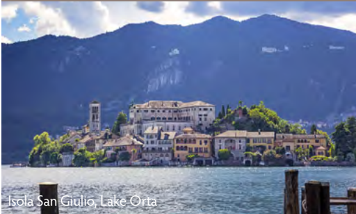
Isola San Giulio, Lake Orta