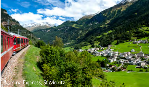
Bernina Express, St Moritz