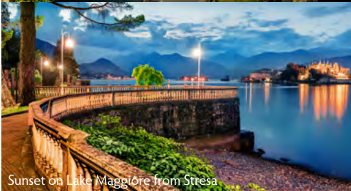
Sunset on Lake Maggiore from Stresa