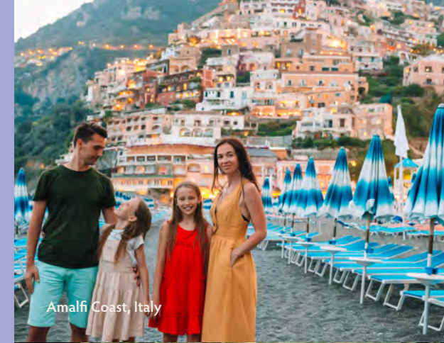
Amalfi Coast, Italy

Embark on a family adventure like no other in Europe, where the continent's rich tapestry of history, breathtaking landscapes, and tantalising cuisines converge to create an unforgettable experience for all. From exploring ancient ruins and interactive museums to hiking through majestic mountains and lounging on sun-drenched coastlines, Europe offers a wealth of opportunities for historical immersion and outdoor exploration that will captivate both adults and children alike. And when it comes to culinary delights, each country in Europe presents its own enticing array of flavours, from mouthwatering gelato in Italy to savory Portuguese tarts and indulgent Swiss fondue. Whether you're strolling through bustling markets, participating in hands-on cooking classes, or simply savouring a leisurely meal together as a family, Europe's diverse culinary scene promises to delight every palate. With Ormina Tours as your guide, let us help you uncover the wonders of Europe and create cherished family memories that will last a lifetime.