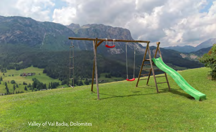
Valley of Val Badia, Dolomites