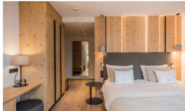
DOLOMITES – Hotel Winkler, Family Suites

Nestled at the base of the majestic north face of the Eiger, Sunstar Grindelwald offers a comprehensive service catering to families. Whether young or young at heart, guests can find comfort and relaxation in the wellness oasis featuring a large swimming pool and log cabin sauna. With two types of family rooms available, everyone can enjoy style, comfort, and stunning mountain views, promising an unforgettable stay.