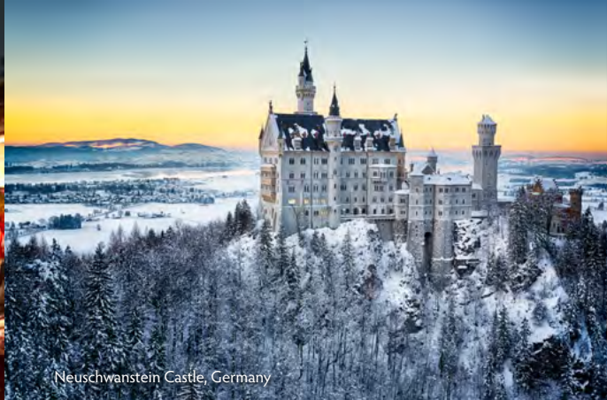
Neuschwanstein Castle, Germany