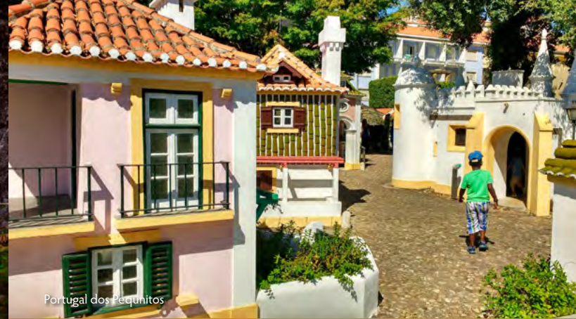
Portugal dos Pequenitos