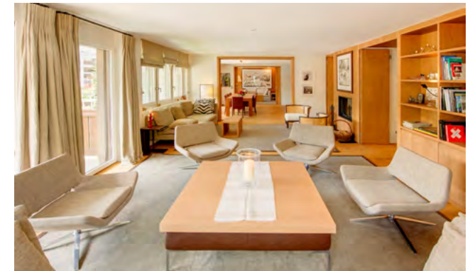
ZERMATT, SWITZERLAND – Zermatt Luxury Chalets & Apartments

Hotel Winkler isn't just a hotel; it's a luxury spa retreat, a haven for sports enthusiasts, and a family-friendly resort nestled in the Dolomites. With its blend of luxury, design, and exclusive offerings, it promises an unparalleled holiday experience. Miriam Winkler and Christof Schuster extend a warm welcome to families seeking relaxation and wellbeing. The hotel features luxurious rooms and suites equipped with modern amenities, ensuring a comfortable stay for families of up to six people per suite.