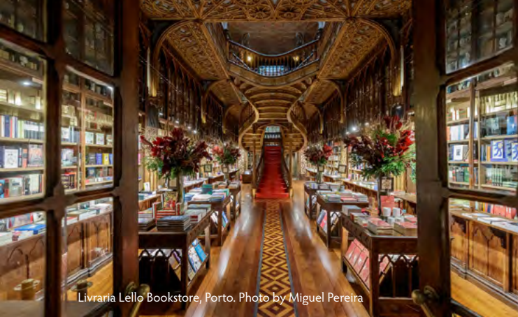
Livraria Lello Bookstore, Porto.