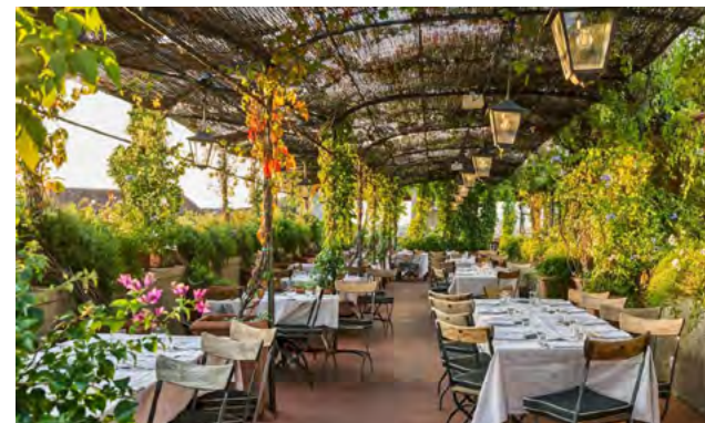
FLORENCE – Grand Hotel Baglioni, Family Rooms

Palazzo Gamba, located opposite Florence Cathedral, extends a warm welcome to families, offering individually designed apartments with fully equipped kitchenettes. Many apartments boast stunning cathedral vistas, while nearby attractions like Palazzo Vecchio and the Uffizi Gallery await just meters away. With spacious layouts, and elegant designs, including some with frescoed ceilings or balconies, each apartment ensures a comfortable and memorable family retreat in the heart of Florence.