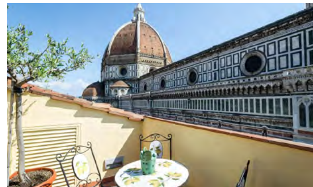
FLORENCE – Palazzo Gamba, Luxury 2&3 Bedroom Apartments

La Piazzetta Guest House, nestled in Sorrento's historic heart, offers refined yet homely accommodations. With Rooms and Apartments featuring distinctive designs and modern comforts, it's an ideal base for exploring the Peninsula's attractions year-round. Conveniently located near Sorrento's main sights, it's the perfect blend of comfort and accessibility for families to enjoy cultural pursuits and immerse in local social life.