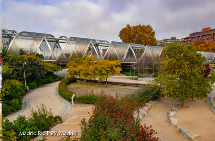
Madrid Río Park, Madrid