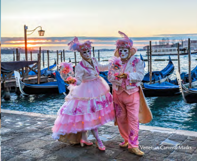
Venetian Carnival Masks