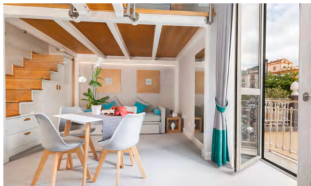
AMALFI COAST – La Piazzetta Guest House, Apartments

Nestled in the charming town of Sant'Agnello, Hotel Corallo boasts a prestigious 4-star rating and a breathtaking clifftop location. With panoramic terraces offering sweeping views of the Gulf of Naples, Vesuvius, and the Sorrentine peninsula, guests are treated to unparalleled vistas. Originally an elegant patrician house, the hotel's rich history dates back to 1910 when it transformed into 'Hotel Cappuccini', frequented by esteemed artists and intellectuals like Luigi Pirandello in the 1930s.