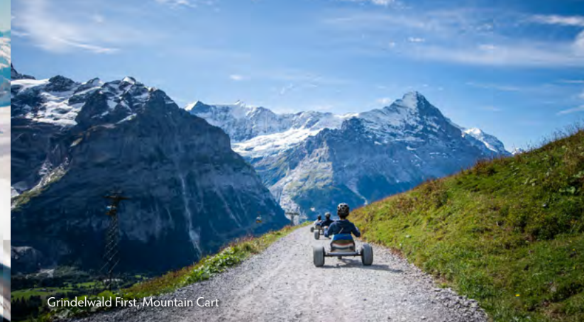
Grindelwald First, Mountain Cart