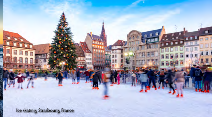
Ice skating, Strasbourg, France