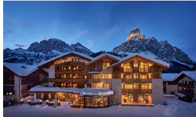
DOLOMITES, COVARA – Residence Amonit, Hotel Marmolada, Apartments

Welcome to Hotel Marmolada, located in the picturesque Val Badia amidst the UNESCO World Heritage Dolomites. Experience a warm, family-friendly atmosphere and indulge in gourmet cuisine. The alpine-style wellness zone ensures relaxation after outdoor adventures. Residence Amonit offers well-appointed 2- and 3- bedroom apartments, with modern amenities and stunning mountain views, perfect for a memorable family holiday.