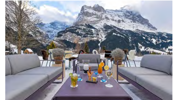
GRINDELWALD, SWITZERLAND – Sunstar, Family Rooms

Welcome to Hotel Marmolada, located in the picturesque Val Badia amidst the UNESCO World Heritage Dolomites. Experience a warm, family-friendly atmosphere and indulge in gourmet cuisine. The alpine-style wellness zone ensures relaxation after outdoor adventures. Residence Amonit offers well-appointed 2- and 3- bedroom apartments, with modern amenities and stunning mountain views, perfect for a memorable family holiday.