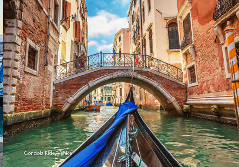
Gondola Ride, Venice