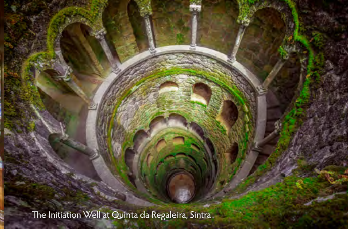
The Initiation Well at Quinta da Regaleira, Sintra