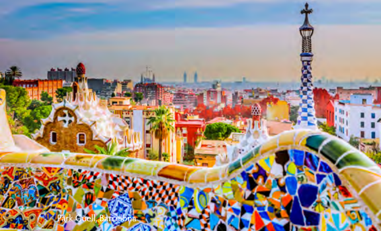
Park Güell, Barcelona