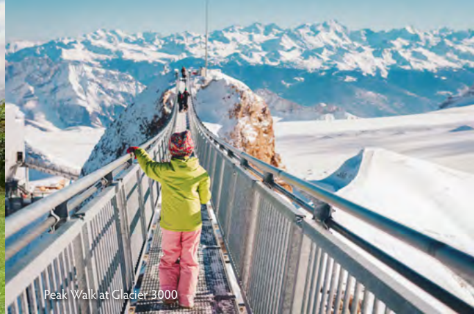
Peak Walk at Glacier 3000