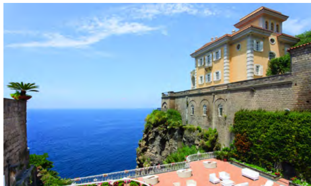
AMALFI COAST – Hotel Corallo, Interconnecting Rooms

Nestled in the charming town of Sant'Agnello, Hotel Corallo boasts a prestigious 4-star rating and a breathtaking clifftop location. With panoramic terraces offering sweeping views of the Gulf of Naples, Vesuvius, and the Sorrentine peninsula, guests are treated to unparalleled vistas. Originally an elegant patrician house, the hotel's rich history dates back to 1910 when it transformed into 'Hotel Cappuccini', frequented by esteemed artists and intellectuals like Luigi Pirandello in the 1930s.