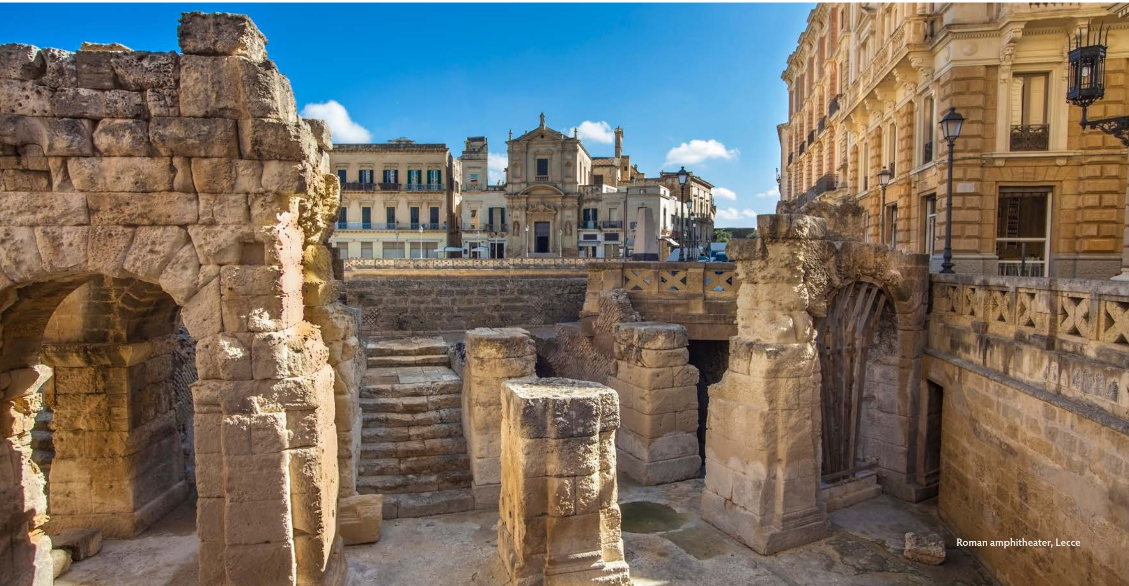
Roman amphitheater, Lecce