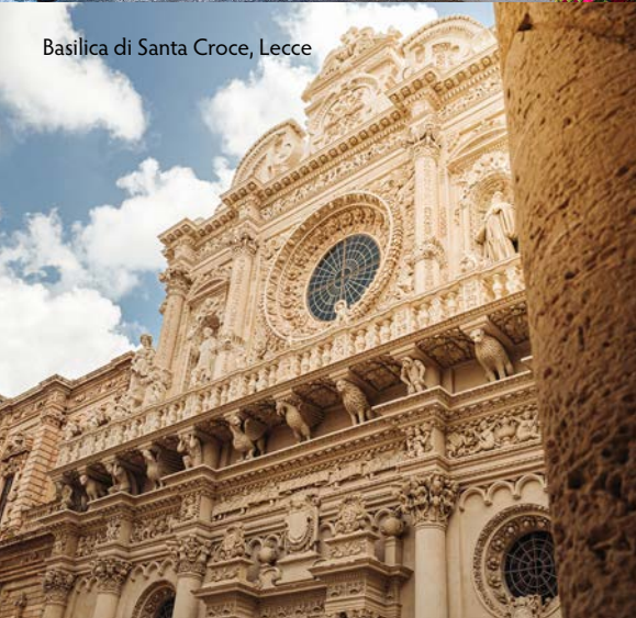
Basilica di Santa Croce, Lecce