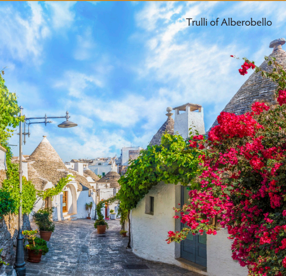
Trulli of Alberobello